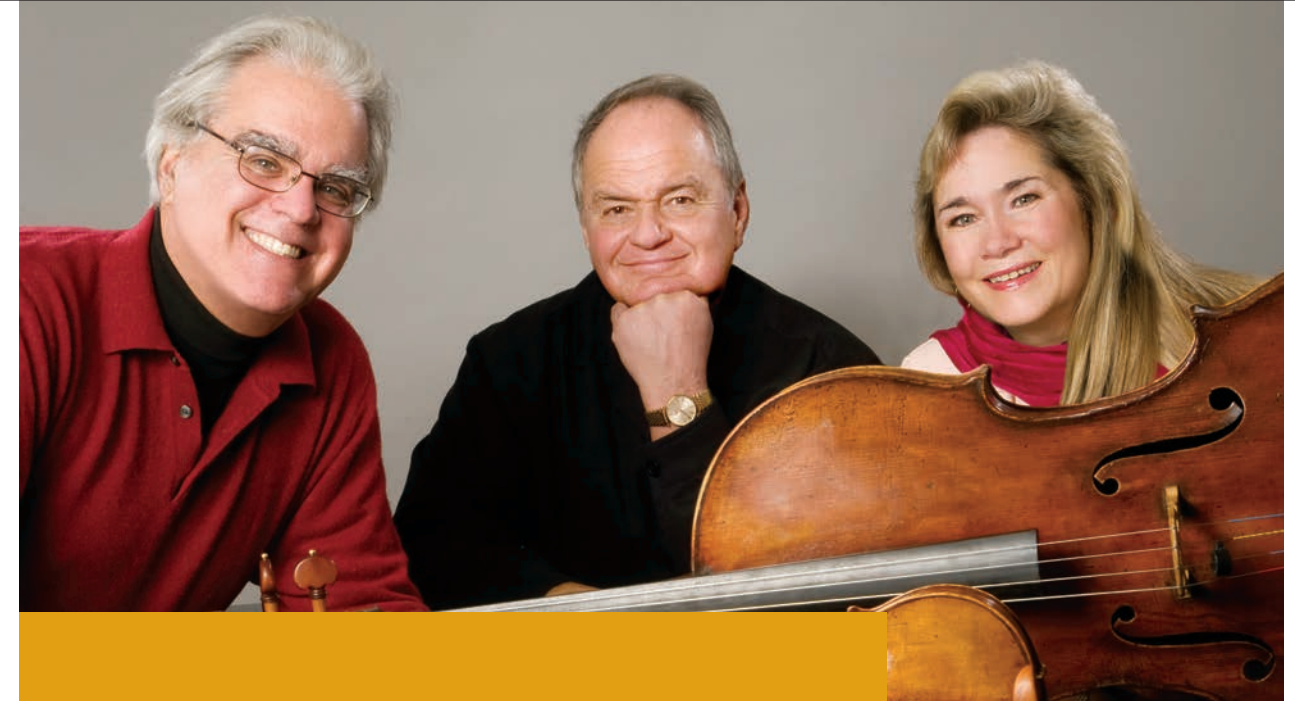
The Kalichstein-Laredo-Robinson Trio