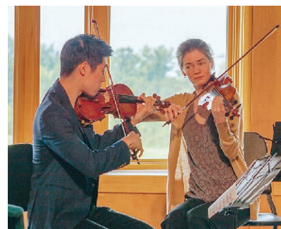
Members of the Kafka Quartet